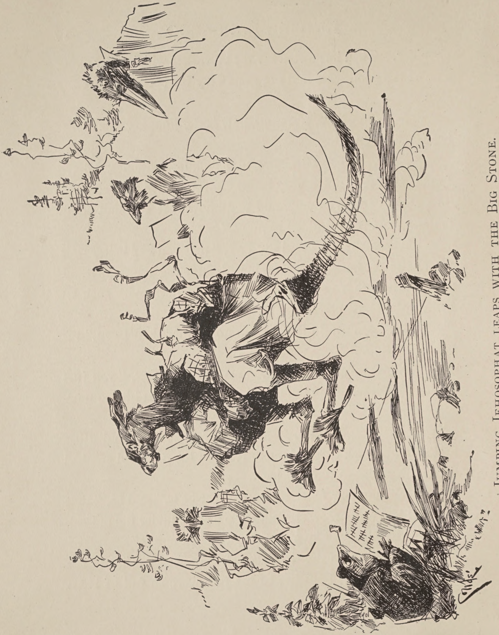
JUMPING JEHOSEPHAT LEAPS WITH THE BIG STONE.